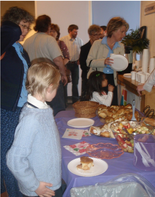
The fabulous Easter Breakfast spread—so hard to choose!

Our last youth group Sunday will be Sunday, May 23 . Sadly, this will also be my last day as the youth minister of Salem and Lyndale. Look for the youth to take part in this exciting celebratory service. And thank you to everyone who has supported the youth group and me over the last year and a half. This position has been such a blessing!