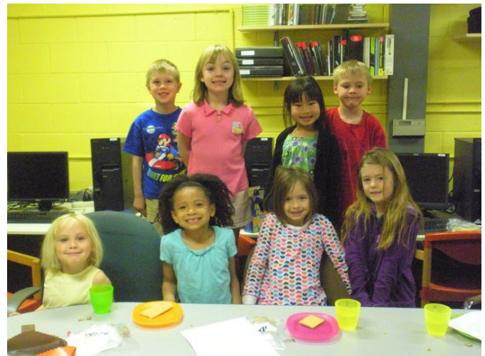
Salem and Lyndale kids enjoying Sunday School and snack time!

Over this year, our Sunday School students have been collecting and raising an offering to give to Heifer Project. With your help, they've raised over $500. Thank you for your assistance to our kids, and to the families that will be served by Heifer.