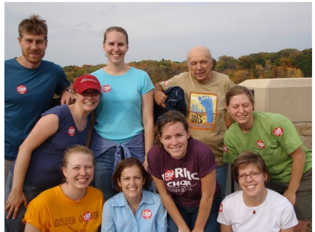
Last year's Crop Walk "Crew" enjoying the experience.